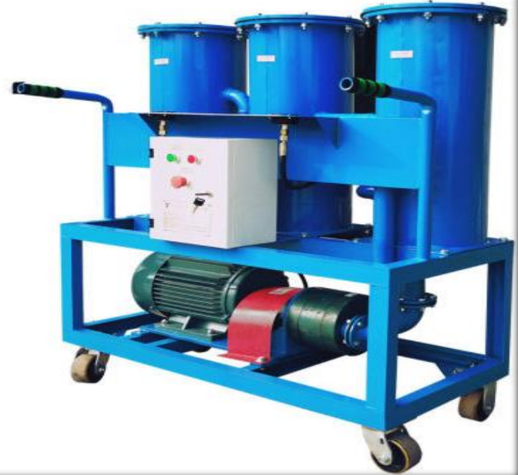
Three Stage Cooker